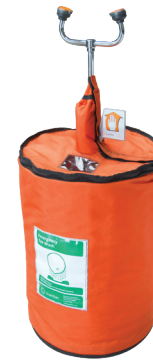
G1562HTR Portable Eyewash/Drench Hose Unit with Heater and Insulation Jacket