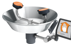
G1750 Eye/Face Wash, Wall Mounted, SS Bowl