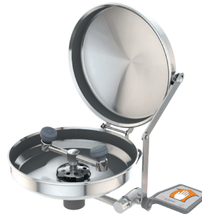
G1814BC Eyewash, Wall Mounted, SS Bowl with Cover