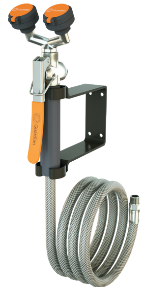
G5026 Eyewash/Drench Hose Dual Purpose Unit, Wall Mounted