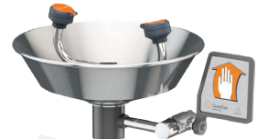
G1825 Eyewash, Pedestal Mounted, SS Bowl