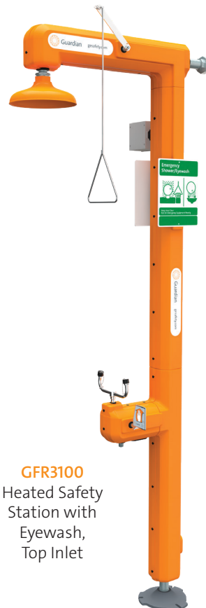
GFR3100 Heated Safety Station with Eyewash, Top Inlet