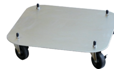
G1562DLY Dolly for Portable Eyewash/Drench Hose Unit