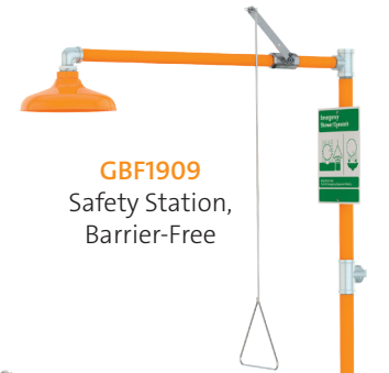
GBF1909 Safety Station, Barrier-Free