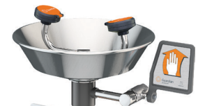
G1760 Eye/Face Wash, Pedestal Mounted, SS Bowl