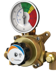
G3600LF Tempering Valve for Eyewash