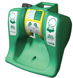
G1540 Portable Eyewash, Gravity-Fed