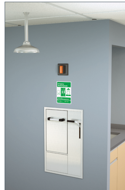
Recessed Safety Station with Drain Pan. Shown with Alarm. GBF2150, AP280-230