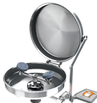
G1750BC Eye/Face Wash, Wall Mounted, SS Bowl with Cover