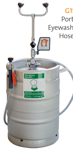
G1562 Portable Eyewash/Drench Hose Unit