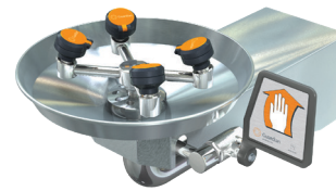
GBF1724 Eye/Face Wash, Barrier-Free