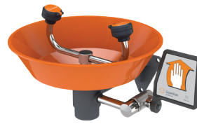
G1814P Eyewash, Wall Mounted, Plastic Bowl