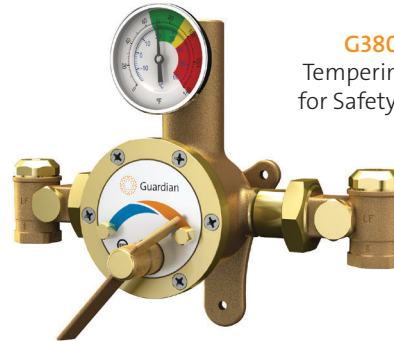
G3800LF Tempering Valve for Safety Station