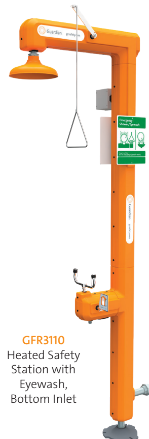
GFR3110 Heated Safety Station with Eyewash, Bottom Inlet