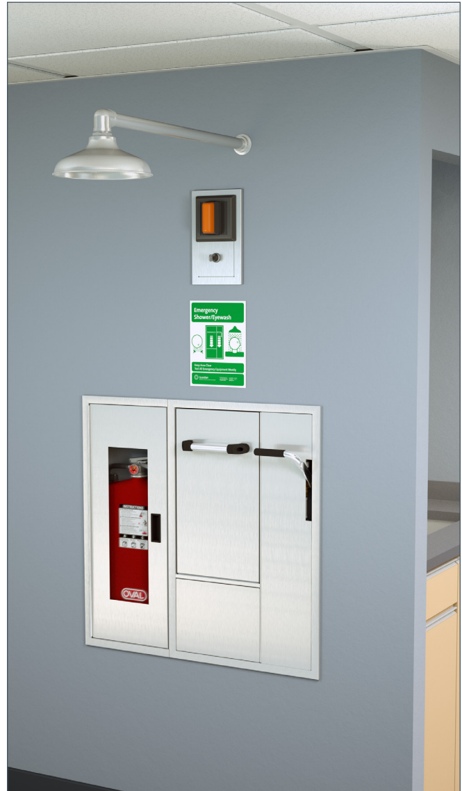
Note: Shown with optional AP280-237 electric light and alarm horn unit with silencing switch. Accommodates Oval fire extinguisher model 10JABC. (Fire extinguisher sold separately)

□ AP250-065 Modesty curtain for wall mounting.