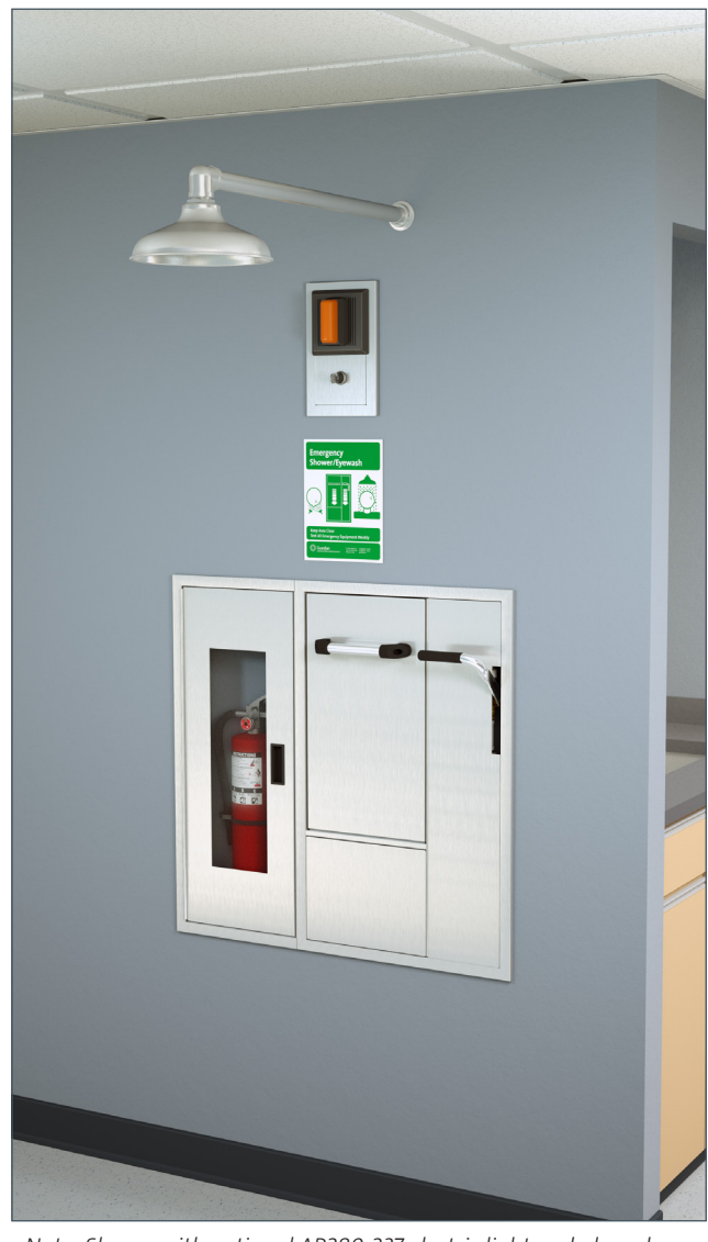
Note: Shown with optional AP280-237 electric light and alarm horn unit with silencing switch. (Fire extinguisher sold separately)