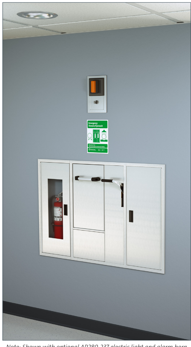
Note: Shown with optional AP280-237 electric light and alarm horn unit with silencing switch. (Fire extinguisher sold separately)

AP250-065 Modesty curtain for wall mounting.