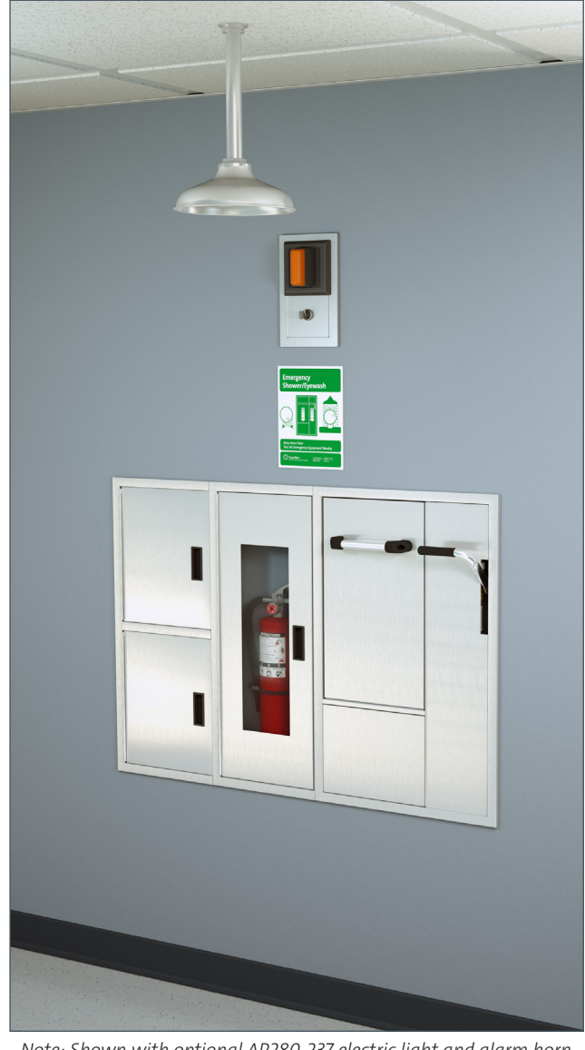
Note: Shown with optional AP280-237 electric light and alarm horn unit with silencing switch. (Fire extinguisher sold separately)

AP250-065 Modesty curtain for wall mounting.