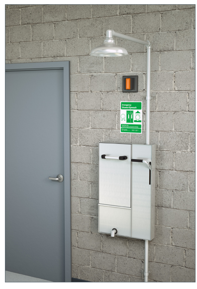
Note: Shown with optional AP280-240 electric light and alarm horn unit (sold separately).