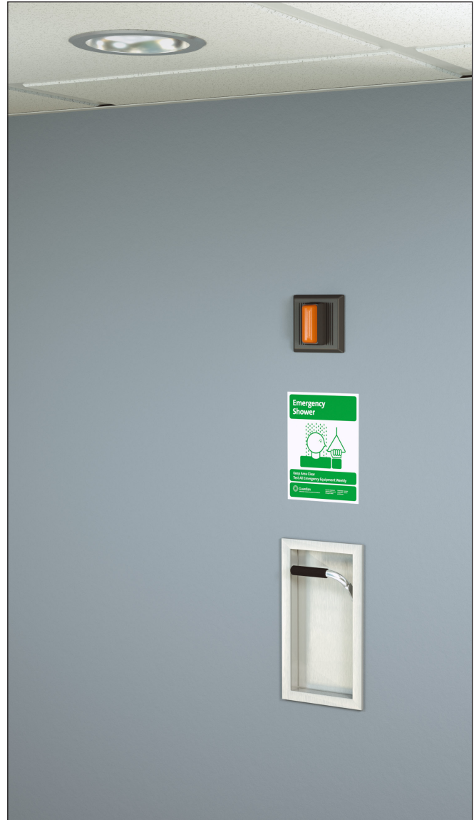
Note: Shown with optional AP280-235 electric light and alarm horn unit (sold separately).